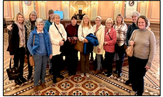
Inside the Capitol building