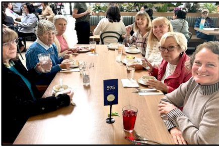
Lunch at Sellands