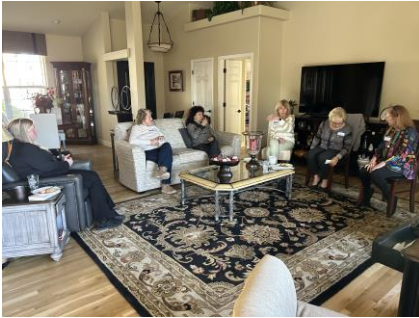
Left: New Members Reception