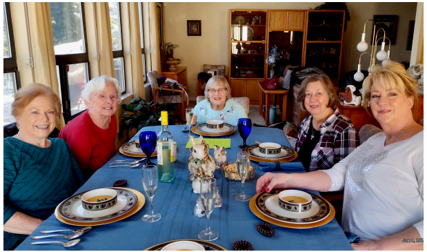
“Happy Cookers” enjoying their gourmet meal