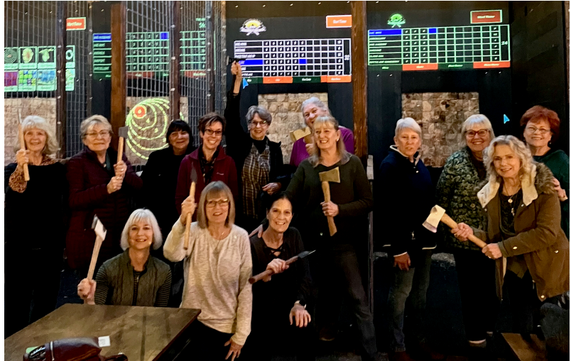
“Girls Just Wanna Have Fun” outing — axe throwing in Auburn